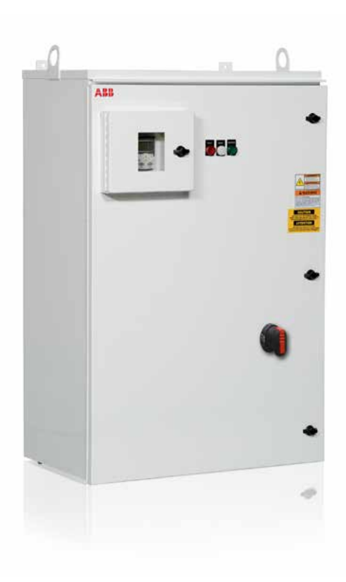
ABB irrigation drives ACS550 stocked 3R irrigation drives, 15 to 200 hp

Easy to use drives that provide reliable pump control are vital to the health of your crops and your bottom line. ABB drives help you protect your investment by safeguarding your system and enabling it to run efficiently to provide the value and dependability you demand. What you choose matters.