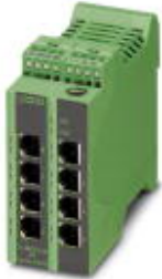
Ethernet Lean Managed Switch with eight 10/100 Mbps RJ45 ports, preconfigured for EtherNet/IP™

Please be informed that the data shown in this PDF Document is generated from our Online Catalog. Please find the complete data in the user's documentation. Our General Terms of Use for Downloads are valid ( http://phoenixcontact.com/download )