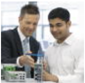
Startup of Phoenix Contact network components and support regarding analysis, consultation/planning or configuration/startup together with a responsible person employed by the initiator.

Service material - FL START-UP SUPPORT - 2701426