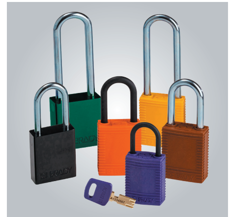
Nine different color options available