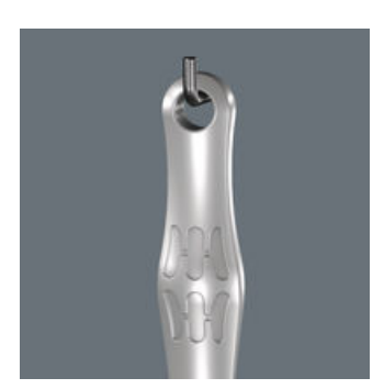
Thanks to its hole the Joker can be neatly hung on the workshop wall.