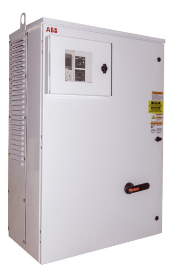
ABB irrigation drive package ACS580 3R irrigation drives, 10 to 200 hp