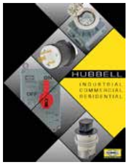
Hubbell Wiring Device-Kellems Full Line Catalog

Hubbell offers an extensive literature library for product support. Downloadable PDFs are available online.