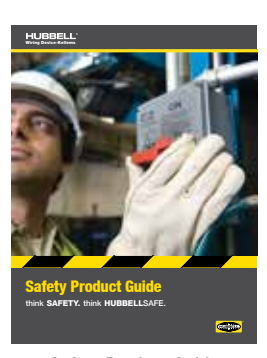
Safety Product Guide