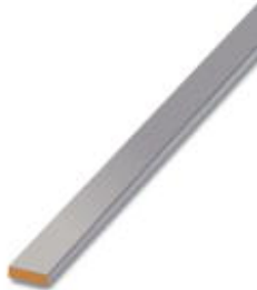
PEN conductor busbar, 3mm x 10 mm, length: 1000 mm

Please be informed that the data shown in this PDF Document is generated from our Online Catalog. Please find the complete data in the user's documentation. Our General Terms of Use for Downloads are valid ( http://phoenixcontact.com/download )