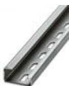
G-profile DIN rail, material: Steel, perforated, height 15 mm, width 32 mm, length 2 m

DIN rail perforated - NS 32 PERF 2000MM - 1201002