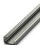
G-profile DIN rail, material: Steel, unperforated, height 15 mm, width 32 mm, length 2 m

DIN rail, unperforated - NS 32 UNPERF 2000MM - 1201015