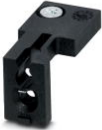
Sleeve receiver for 1.5 mm 2 sleeves

Please be informed that the data shown in this PDF Document is generated from our Online Catalog. Please find the complete data in the user's documentation. Our General Terms of Use for Downloads are valid ( http://phoenixcontact.com/download )