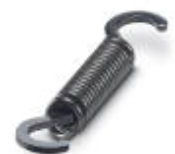
Spare recuperating spring

Replacement spring - CRIMPFOX/ SPR-3 - 1212036