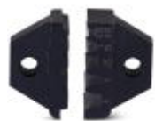
Spare die for CRIMPFOX 6

Replacement die - CRIMPFOX 6/DIE - 1212035