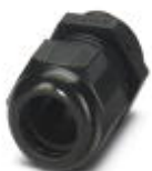
Cable gland, Cable gland material: Polyamide 6, External cable diameter 11 mm ... 17 mm, Shielding: No, Connecting thread: M25, Color: jet black RAL 9005

Cable gland - G-INS-M25-M68N-PNES-BK - 1411134