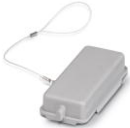
HEAVYCON protective cover, type B16, for supporting base element with single locking latch, with retaining cord, IP54, PA

Please be informed that the data shown in this PDF Document is generated from our Online Catalog. Please find the complete data in the user's documentation. Our General Terms of Use for Downloads are valid ( http://phoenixcontact.com/download )