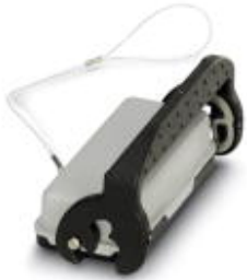
HEAVYCON protective cover, type B16, for sleeve housing without single locking latch, with retaining cord, IP54

Please be informed that the data shown in this PDF Document is generated from our Online Catalog. Please find the complete data in the user's documentation. Our General Terms of Use for Downloads are valid ( http://phoenixcontact.com/download )