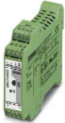
Primary-switched MINI DC/DC converter for DIN rail mounting, input: 1-phase, output: 24 V DC/1 A

Please be informed that the data shown in this PDF Document is generated from our Online Catalog. Please find the complete data in the user's documentation. Our General Terms of Use for Downloads are valid ( http://phoenixcontact.com/download )