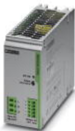
Primary-switched TRIO POWER power supply for DIN rail mounting, input: 1-phase, output: 24 V DC/10 A

Please be informed that the data shown in this PDF Document is generated from our Online Catalog. Please find the complete data in the user's documentation. Our General Terms of Use for Downloads are valid ( http://phoenixcontact.com/download )