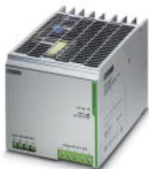
Primary-switched TRIO POWER power supply for DIN rail mounting, input: 3-phase, output: 24 V DC/40 A

Please be informed that the data shown in this PDF Document is generated from our Online Catalog. Please find the complete data in the user's documentation. Our General Terms of Use for Downloads are valid ( http://phoenixcontact.com/download )