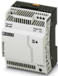
Primary-switched STEP POWER power supply for DIN rail mounting, input: 1-phase, output: 12 V DC/5 A

Please be informed that the data shown in this PDF Document is generated from our Online Catalog. Please find the complete data in the user's documentation. Our General Terms of Use for Downloads are valid ( http://phoenixcontact.com/download )