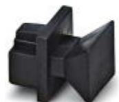
Dust protection caps for RJ45 socket

Dust protection - FL RJ45 PROTECT CAP - 2832991