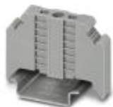
End clamp, width: 9.5 mm, color: gray