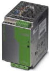
DIN rail power supply unit 24 V DC/10 A, primary switched-mode, 3-phase.

Please be informed that the data shown in this PDF Document is generated from our Online Catalog. Please find the complete data in the user's documentation. Our General Terms of Use for Downloads are valid ( http://phoenixcontact.com/download )