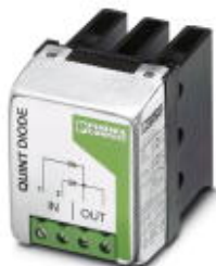
Redundancy module QUINT-DIODE/40

Please be informed that the data shown in this PDF Document is generated from our Online Catalog. Please find the complete data in the user's documentation. Our General Terms of Use for Downloads are valid ( http://phoenixcontact.com/download )