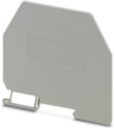
Partition plate, Length: 99 mm, Width: 2 mm, Height: 90 mm, Color: gray

Please be informed that the data shown in this PDF Document is generated from our Online Catalog. Please find the complete data in the user's documentation. Our General Terms of Use for Downloads are valid ( http://phoenixcontact.com/download )