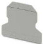
Partition plate, Length: 56 mm, Width: 1.5 mm, Height: 45.7 mm, Color: gray