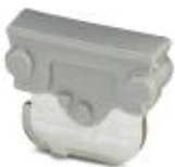
Feed-through connector, Length: 10.5 mm, Width: 4 mm, Color: gray

Feed-through connector - P-FIX - 3038956