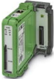
Head station for monitoring up to four PROFIBUS networks

Please be informed that the data shown in this PDF Document is generated from our Online Catalog. Please find the complete data in the user's documentation. Our General Terms of Use for Downloads are valid ( http://phoenixcontact.com/download )