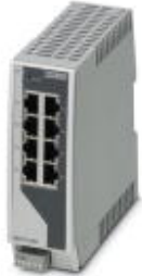
Managed Switch 2000, 8 RJ45 ports 10/100 Mbps, degree of protection: IP20

Please be informed that the data shown in this PDF Document is generated from our Online Catalog. Please find the complete data in the user's documentation. Our General Terms of Use for Downloads are valid ( http://phoenixcontact.com/download )