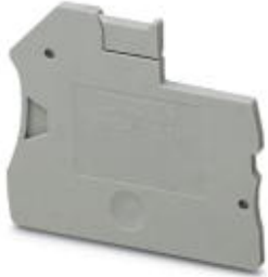
End cover, length: 47.6 mm, width: 2.2 mm, height: 39.8 mm, color: gray

Please be informed that the data shown in this PDF Document is generated from our Online Catalog. Please find the complete data in the user's documentation. Our General Terms of Use for Downloads are valid ( http://phoenixcontact.com/download )