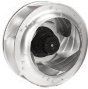
Duct Ring: DR400A (optional)