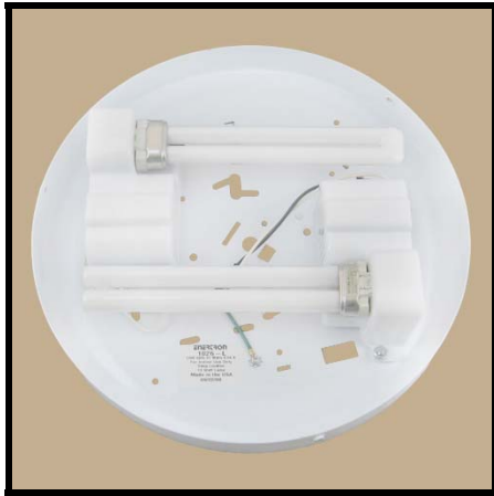
Compact Fluorescent Magnetic Drum 1026-L Shown

LEADING THE INDUSTRY WITH QUALITY YOU CAN DEPEND ON