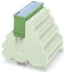
Replacement module electronics for IB ST (ZF) 24 DO 32/2

Please be informed that the data shown in this PDF Document is generated from our Online Catalog. Please find the complete data in the user's documentation. Our General Terms of Use for Downloads are valid ( http://phoenixcontact.com/download )