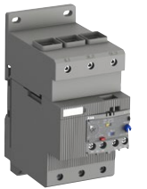
DB96 + EF96