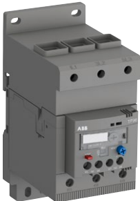
DB96 + TF96