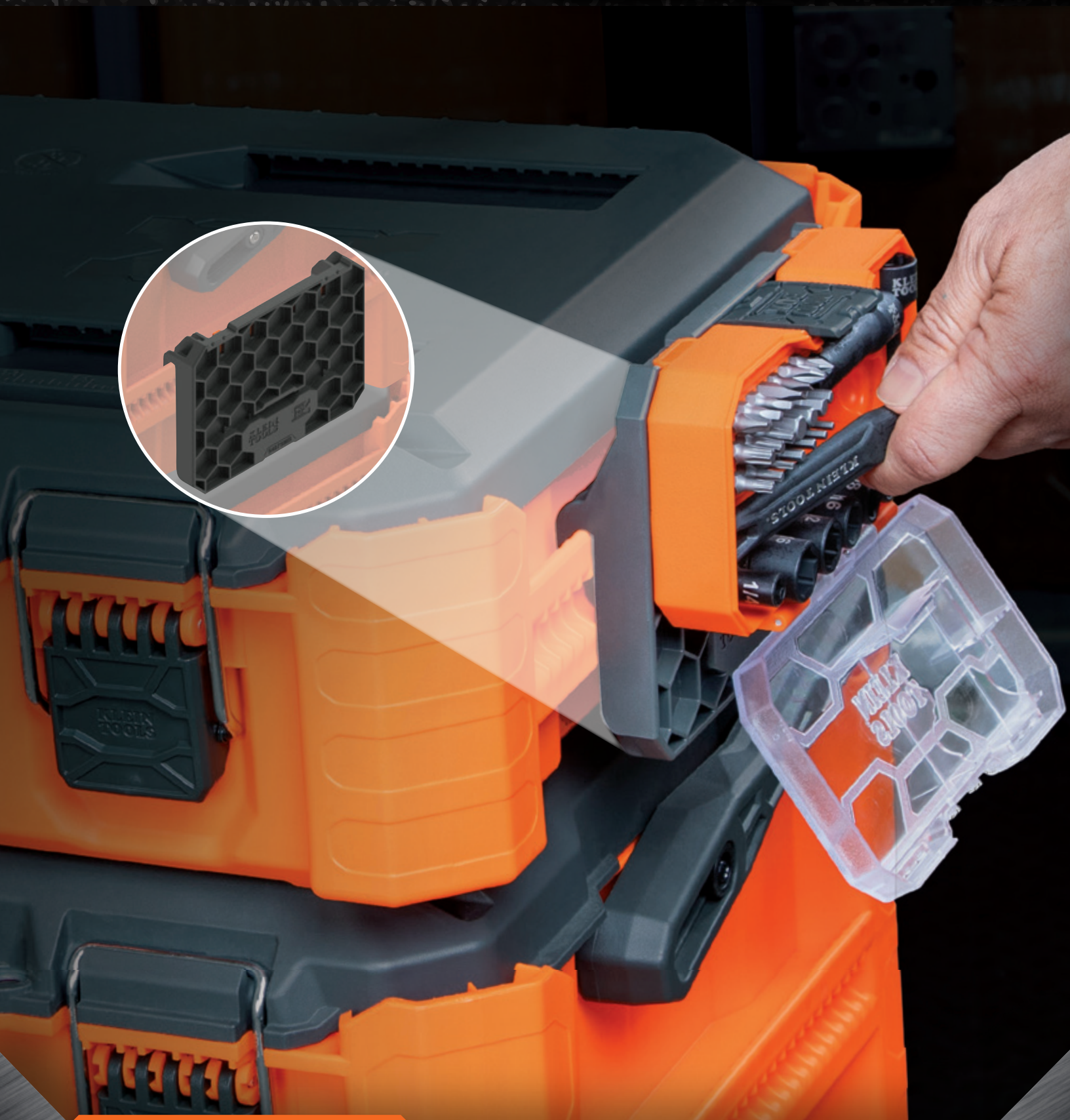
Connects to MODbox™ Mobile Workstation