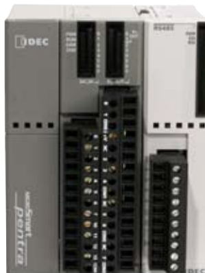
FC5A PLC Slim Type CPU