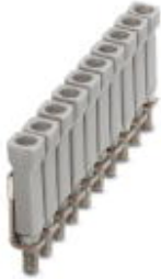
Jumper, Pitch: 6 mm, Number of positions: 10, Color: gray

Please be informed that the data shown in this PDF Document is generated from our Online Catalog. Please find the complete data in the user's documentation. Our General Terms of Use for Downloads are valid ( http://phoenixcontact.com/download )