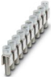
Fixed bridge, Pitch: 8 mm, Number of positions: 10, Color: silver

Please be informed that the data shown in this PDF Document is generated from our Online Catalog. Please find the complete data in the user's documentation. Our General Terms of Use for Downloads are valid ( http://phoenixcontact.com/download )