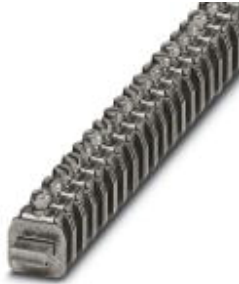
Connection terminal block, Connection method Screw connection, Cross section: 0.5 mm 2 - 6 mm 2 , Width: 7 mm, Color: silver

Please be informed that the data shown in this PDF Document is generated from our Online Catalog. Please find the complete data in the user's documentation. Our General Terms of Use for Downloads are valid ( http://phoenixcontact.com/download )