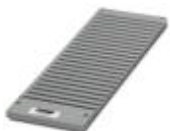
Plastic magazine for CMS-P1 plotter. Accepts 22 Zack band strips