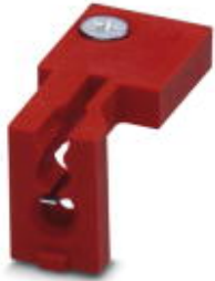
Sleeve receiver for 1.0 mm 2 sleeves

Please be informed that the data shown in this PDF Document is generated from our Online Catalog. Please find the complete data in the user's documentation. Our General Terms of Use for Downloads are valid ( http://phoenixcontact.com/download )