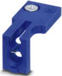
Sleeve receiver for 2.5 mm 2 sleeves

Please be informed that the data shown in this PDF Document is generated from our Online Catalog. Please find the complete data in the user's documentation. Our General Terms of Use for Downloads are valid ( http://phoenixcontact.com/download )