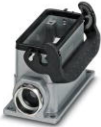
Box mounting base, with single locking latch, height 67 mm, with screw connection, 1x Pg21

Please be informed that the data shown in this PDF Document is generated from our Online Catalog. Please find the complete data in the user's documentation. Our General Terms of Use for Downloads are valid ( http://phoenixcontact.com/download )