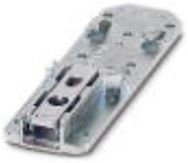
Universal DIN rail adapter

Assembly adapters - UTA 107/30 - 2320089