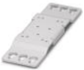
Universal wall adapter

Assembly adapters - UWA 182/52 - 2938235