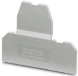
End cover, Length: 67 mm, Width: 2.5 mm, Height: 62 mm, Color: gray

Please be informed that the data shown in this PDF Document is generated from our Online Catalog. Please find the complete data in the user's documentation. Our General Terms of Use for Downloads are valid ( http://phoenixcontact.com/download )