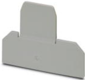
Partition plate, Length: 75 mm, Width: 2.5 mm, Height: 67 mm, Color: gray

Please be informed that the data shown in this PDF Document is generated from our Online Catalog. Please find the complete data in the user's documentation. Our General Terms of Use for Downloads are valid ( http://phoenixcontact.com/download )