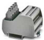
VARIOFACE module, with two equipotential busbars (P1, P2) for potential distribution, for mounting on NS 35 rails. Module width: 70.4 mm

Interface module - VIP-2/SC/PDM-2/24 - 2315269