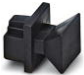
Dust protection caps for RJ45 socket

Dust protection - FL RJ45 PROTECT CAP - 2832991