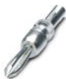
Test plugs, Color: silver