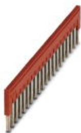
Plug-in bridge, Pitch: 5.2 mm, Number of positions: 20, Color: red

Please be informed that the data shown in this PDF Document is generated from our Online Catalog. Please find the complete data in the user's documentation. Our General Terms of Use for Downloads are valid ( http://phoenixcontact.com/download )