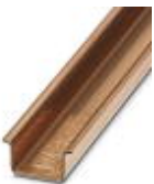
DIN rail, material: Copper, unperforated, 1.5 mm thick, height 15 mm, width 35 mm, length: 2 m

DIN rail, unperforated - NS 35/15 CU UNPERF 2000MM - 1201895