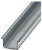
DIN rail, material: Galvanized, unperforated, height 15 mm, width 35 mm, length: 2 m

DIN rail, unperforated - NS 35/15 ZN UNPERF 2000MM - 1206586