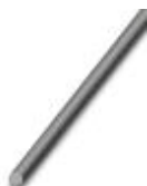
Connection pin, Length: 1000 mm, Color: gray