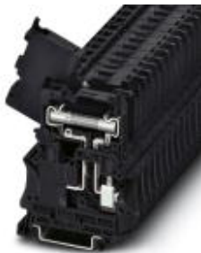
Lever-type fuse terminal block, black, for 6.3 x 32 mm G fuse inserts

Please be informed that the data shown in this PDF Document is generated from our Online Catalog. Please find the complete data in the user's documentation. Our General Terms of Use for Downloads are valid ( http://phoenixcontact.com/download )