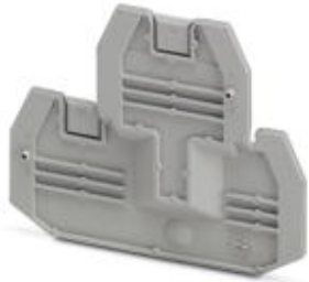
End cover, Length: 69.9 mm, Width: 2.2 mm, Height: 57.5 mm, Color: gray

Please be informed that the data shown in this PDF Document is generated from our Online Catalog. Please find the complete data in the user's documentation. Our General Terms of Use for Downloads are valid ( http://phoenixcontact.com/download )